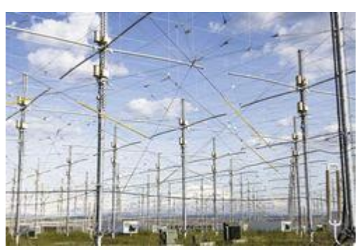
The HAARP antenna array at the University of Alaska Fairbanks.

Alaska Fairbanks in 2021. PARS is a group of more than 50 researchers committed to meeting the growing demand for skilled scientists and engineers with knowledge of the special